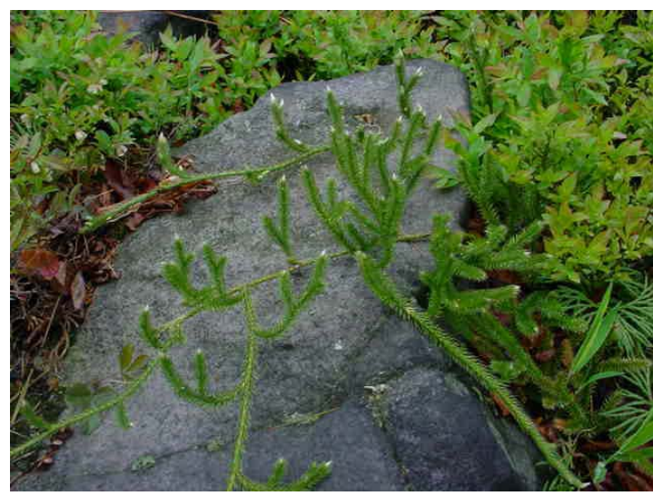
Wolf Claw Clubmoss