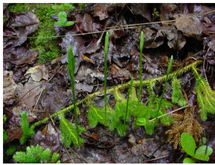
Cones on Wolf Claw Clubmoss

Running Clubmoss Running Pine Clubmoss Common Clubmoss Stag Horn Clubmoss